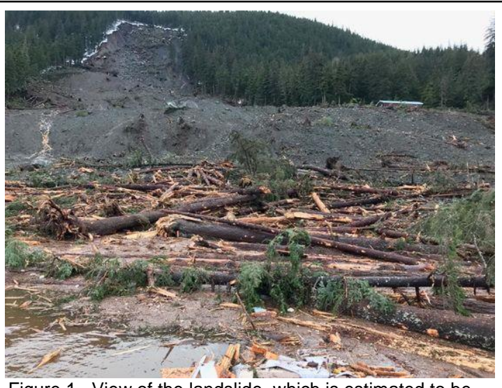
Figure 1. View of the landslide, which is estimated to be 600-ft long and several hundred feet across.

Introduction: On December 2, 2020, following record-breaking rainfall, Haines, Alaska experienced a landslide that tore through part of the community (Figure 1), destroying four homes, making several more uninhabitable, and resulting in two presumed fatalities (Kunze and Brooks 2020; Vera and Rose 2020). This landslide occurred where no one anticipated - in an area thought to be safe by residents and community planners (Godinez 2020). For example, focus has been on the only road connecting Haines to all points inland - the Haines Highway - that runs along the base of steep, ~1,500-m-high peaks notorious for producing debris flows during rain events (Figure 2). The Haines Highway milepost (MP) 19 area is one of the costliest stretches of road, requiring repeated