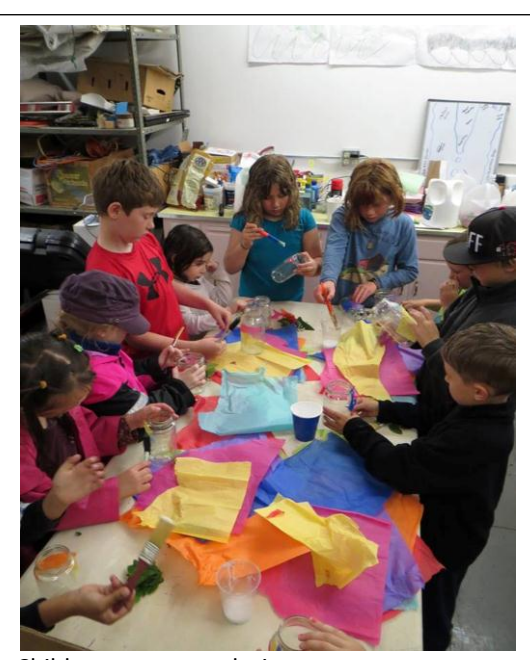
Children create art during summer camp at the museum.