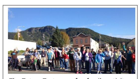
The Totem Trot was a fun family activity that raised $5,000 for the museum.

The Haines Borough is an important part of our funding. All of our staffing is paid for by the Borough. This year we are leveraging those funds to bring in more money for programming, exhibitions and art acquisition. It is still nearly impossible to raise money for regular staff salaries and benefits from grant sources. However, we can raise money for special project staff, if overseen by our regular staff. Thus, we continue to be grateful for the Borough's support. By having staff, we are able to write the grants and provide the programs that bring more activities for the community.