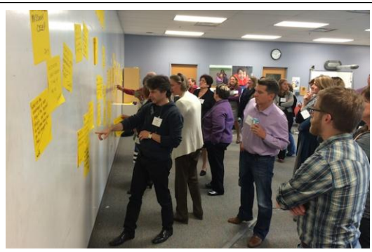
The museum is one of ten Alaska arts groups participating in the Rasmuson Foundation's New Pathways-Alaska program.

Supporting our Professionalism and Quality: The Sheldon Museum is rising to the challenge of finding more ways to be relevant to the Haines community. To help us, we applied for, and were one of two Alaska museums accepted into New Pathways-Alaska , a Rasmuson Foundation program designed to improve staff and board capabilities to address complex challenges. Through our training, we are learning how to identify complex challenges and determine what underlying assumptions we have that might keep us from finding successful solutions. This winter we will begin testing small programs with funding from the Rasmuson Foundation.