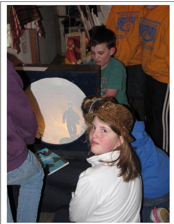
Haines School's fourth grade visited Strung Up and Reconfigured: Puppetry in Haines and Beyond in March.

The museum's historic photographs are popular business enhancements. This year photographs were provided to Fort Seward businesses. We are closely