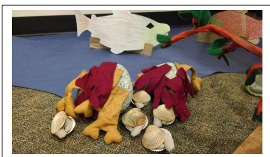
Clams, seaweed, and fish ready to gather in Fish Camp.

Supporting Young Families: A new preschool and early elementary educational area's interactive exhibits changed every 2-3 months. A Fish Camp made way for Preparing for Winter , and a Tlingit Winter Clan House . Preschool children used displays imagined and created by Julie Folta, Diane Sly and the Children's Reading Foundation Board. Play incorporated a smokehouse with cardboard salmon, a bonfire with fabric hotdogs and marshmallows, berries and apples to pick and make into small pies in a play oven, and a small clan house filled with child-sized regalia, rattles and drums. We knew the area was a success when the first child to play in it refused to leave when his parents were ready to go.